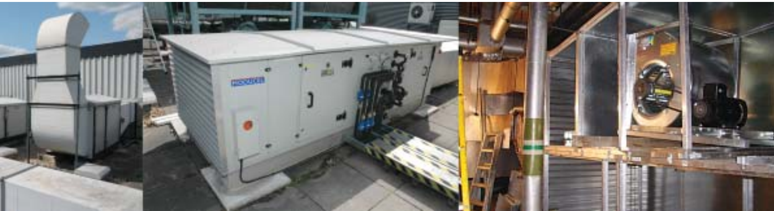
Moducel air handlers, supplied factory assembled or 'Flat Pack' (site assembled)

All our projects and refurbishment work, including all the components used, are fully guaranteed and supported by the Eaton-Williams nationwide service and maintenance operation.